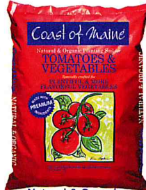
Natural & Organic Planting Soil for TOMATOES & VEGETABLES