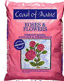
Natural & Organic Planting Soil for ROSES & FLOWERS

Coast of Maine Brands rebate gift certificate offer may not be used or combined with any other offer on identical product purchases. Limit two (2) gift certificates per customer and/or household address. Offer valid ONLY at independent retail stores and garden centers. Please allow 8-10 weeks after mailing for receipt of your certificate. COMPLETED FORM MUST BE ACCOMPANIED BY AN ORIGINAL, DATED, ITEMIZED SALES RECEIPT(S) INCLUDING IDENTIFIABLE STORE NAME & ADDRESS - MUST HAVE THE CORRECT UPC CODES IN ORDER TO BE PROCESSED. Only itemized receipts will be accepted. Nonconforming, duplicate or additional requests will not be honored, acknowledged, or returned. Coast of Maine Brands is not responsible for any lost, late, stolen, incomplete, illegible, illegible, misdirected, or postage due mail. Incomplete requests are ineligible and will not be processed. Offer void where prohibited by law. Coast of Maine's rebate offer entitles the customer to a gift certificate for use only at the store where the purchase was made. Cannot be traded in for cash. Send rebate program inquires to custserve@coastofmaine.com .